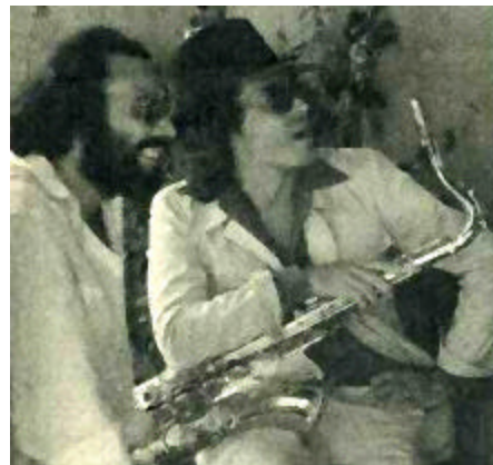
Antonello Venditti and Gato Barbieri in the 1970's

Venditti, long known for the sincerity and passion of his singing is a natural match with Gato's passionate playing. The two first collaborated on Venditti's 1979 Buona Domenica and have also played together live on at least a few occasions over the years.